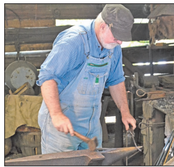
Blacksmithin' is one of the many live demonstrations of pioneer crafts available at the annual Fall Festival.