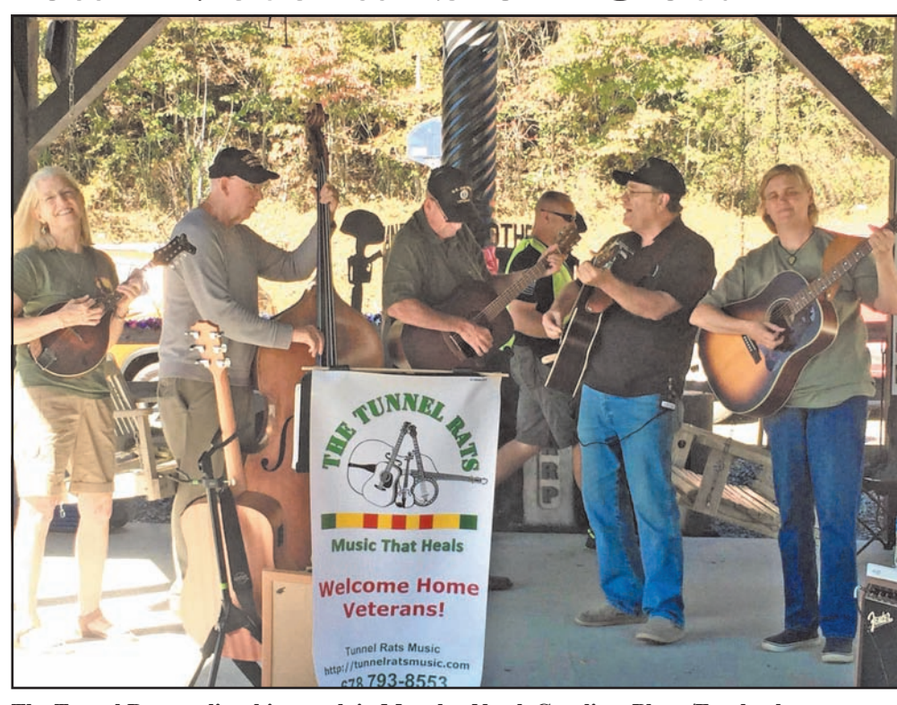
The Tunnel Rats earlier this month in Murphy, North Carolina.